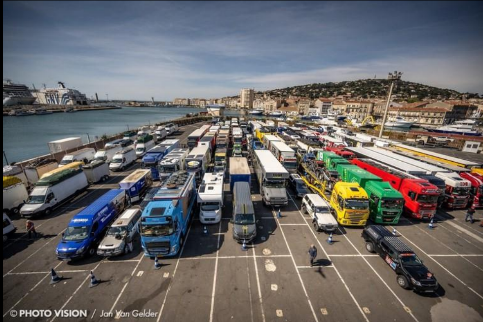
Convoy arrives in Agadir