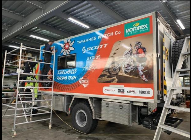
Edelweiss Racing Team installing the deco kit by ArtEdge Development, on Desert Fox truck