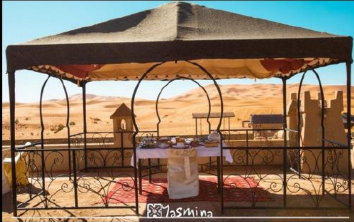
Hotel Yasmina at the foot of the dunes in Merzouga