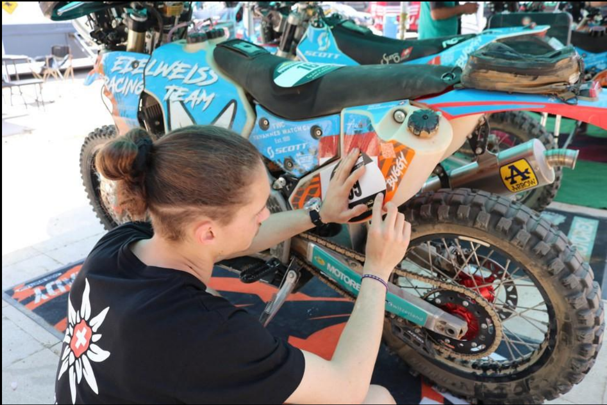
Numbering before technical inspection