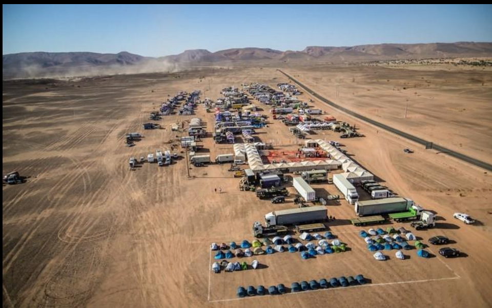
The entire bivouac from the air