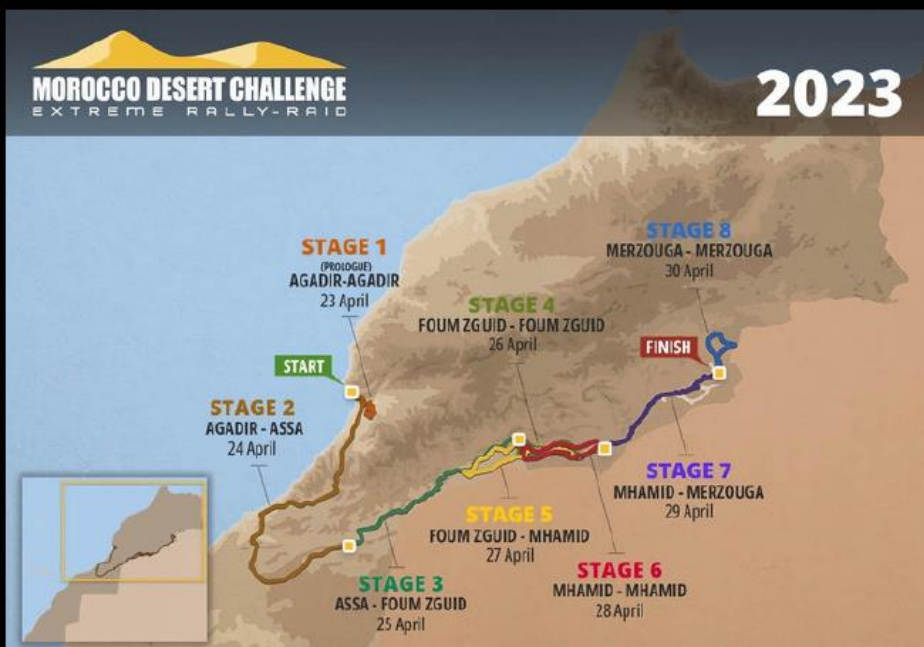
MDC 2023 itinerary