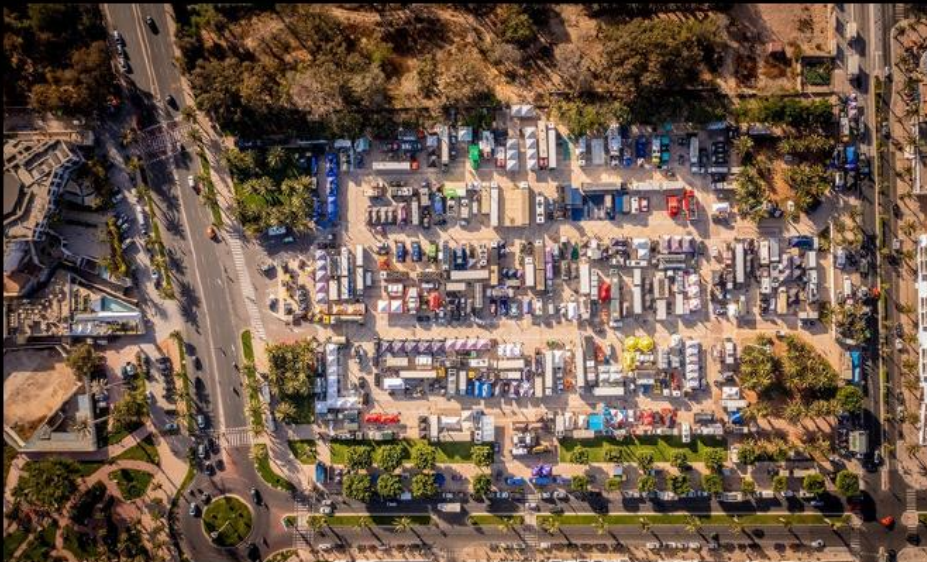
Agadir, starting point of the MDC 2023 and first bivouac in Al Amal place