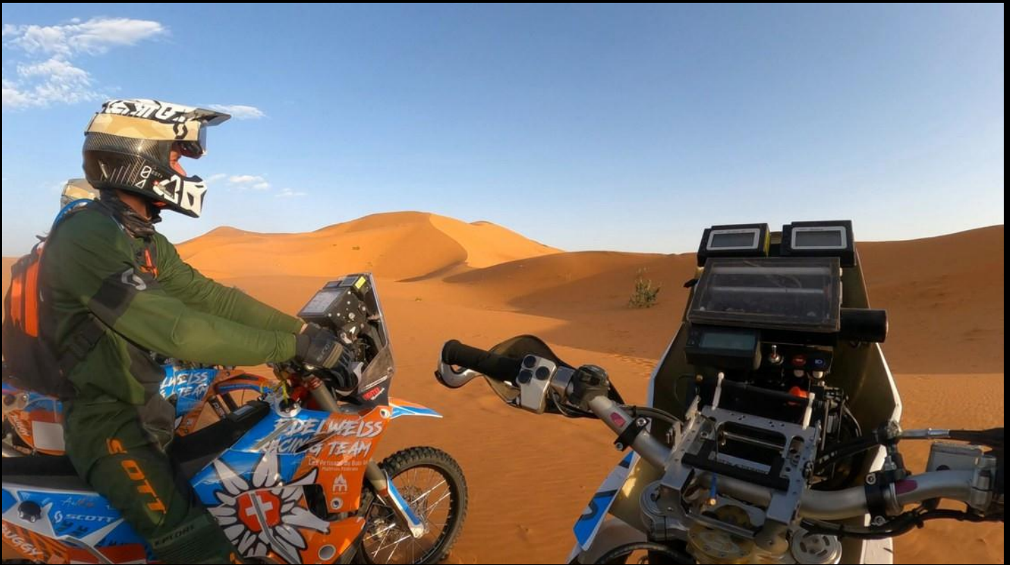
The endless dunes of Erg Chebbi as a training ground...